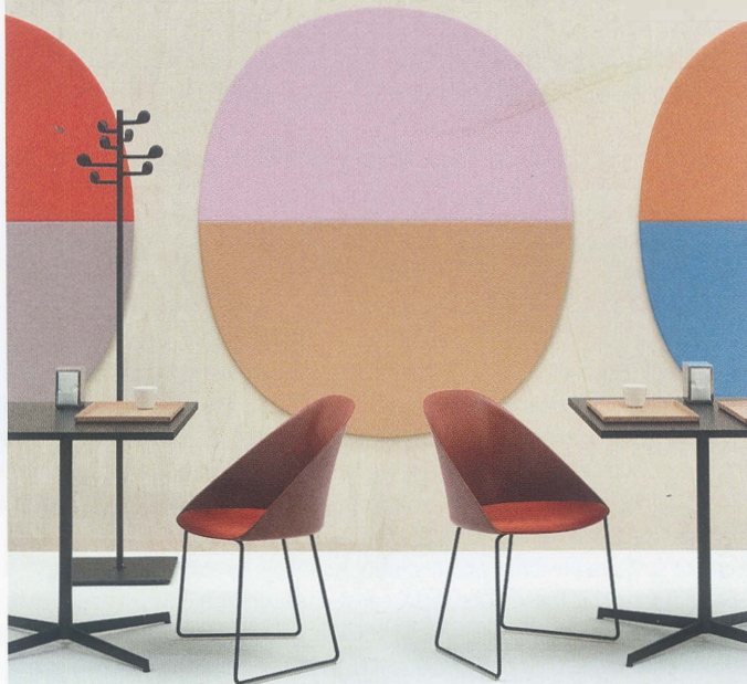
The enveloping sides of Lievore Altherr's Cila chair for Arper cosset and protect. The shapely plastic shell comes in six colors (with optional cushion) or fully upholstered. Which to choose? space 339