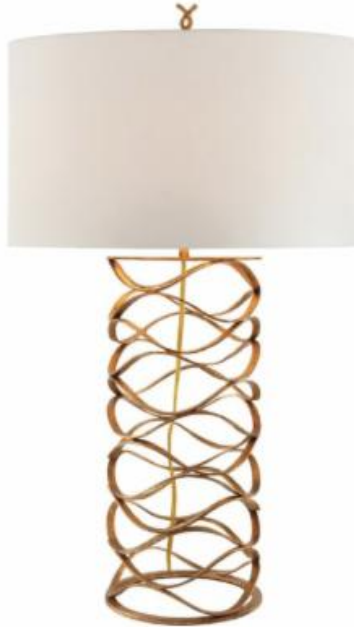
Bracelet Table Lamp in Gilded Iron with Linen Shade