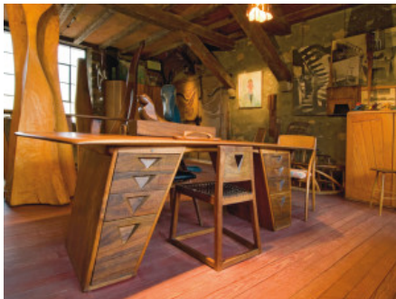
Made from American walnut with exotic-wood decorative elements, Esherick's 1939 flat top desk, with its matching chair, was inspired by the humble sawhorse.

Wharton Esherick (1897–1970) was a true American original. An academically trained but unsuccessful painter, in 1924 he abandoned brushes and oils for chisels and wood. For the next half century, Esherick combined his passion for modern art with his skill at working hardwood to produce sensually organic sculptures, furniture, interiors, and buildings. By the time of his death, Esherick was recognized as a pioneer whose vision of high-art craftsmanship and extraordinary body of work were crucial in establishing what we now know as the American Studio Craft Movement.