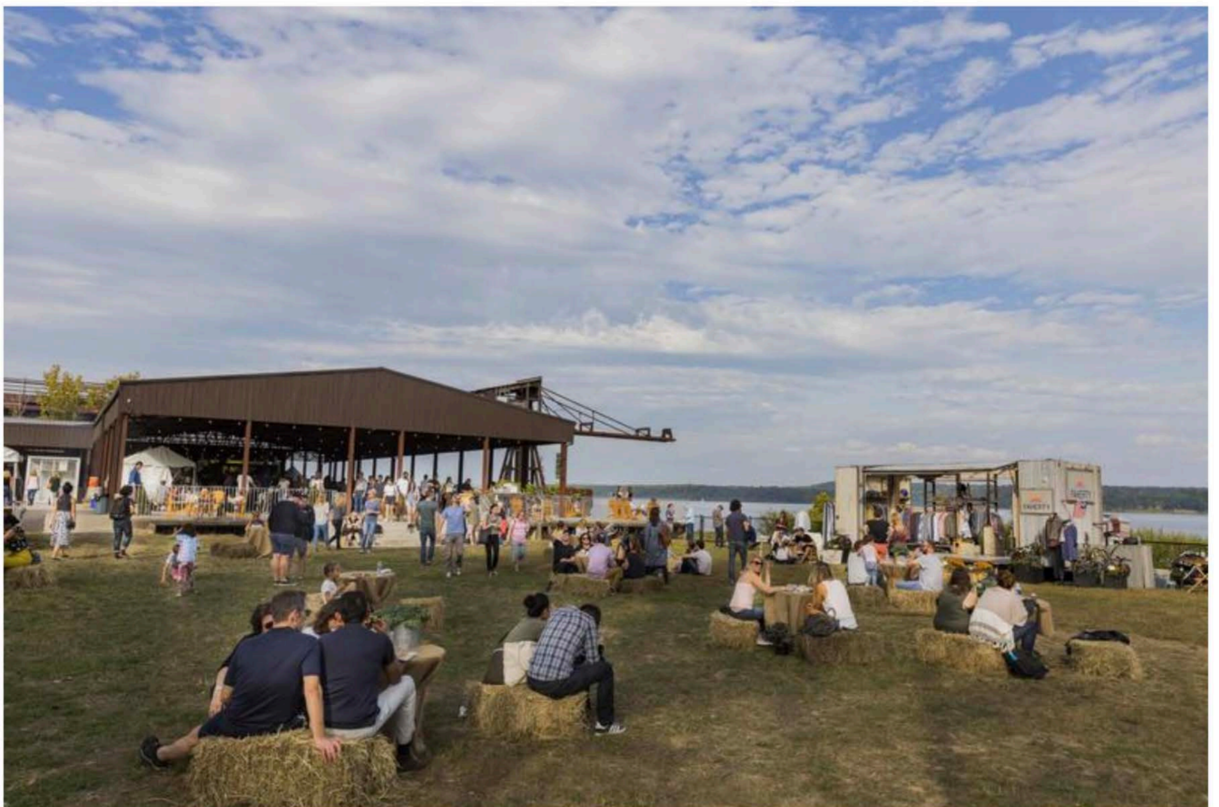
Last year's Field + Supply fair