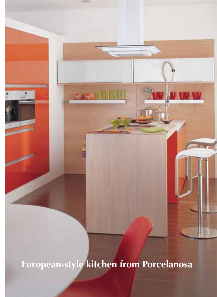
European-style kitchen from Porcelanosa

I also love the new surface treatments that are showing up on both natural and manmade