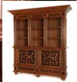
Dutch Renaissance Armoire, with door detail, by Langin Designs

countertops—leathered and pebbled textures that not only look terrific but also offer greater durability than the honed or polished finishes that have been the norm for some time. And look out for large-format porcelain tiles in interesting new textures, including some that look just like wood—you won't believe your eyes!