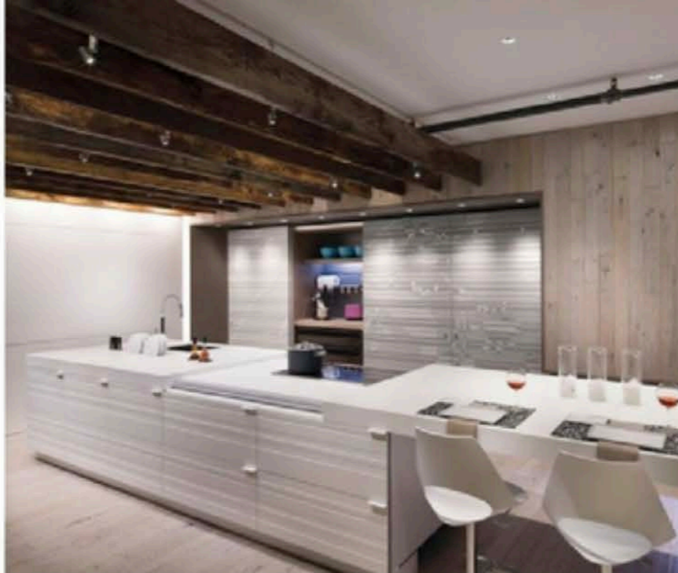
Bazzèo's newest addition to its Gaia series is Gaia Tech, a line of cabinets created for those with limited space who want to conceal their kitchen. Offered in a wide array of colors and finishes, including Corian, and formed of recycled and regenerated wood, it features sliding components that enable the island to function as a cooking, dining and entertainment area. When not in use, the cooktop and prep area can be concealed with a push of a button. Storage and laundry are enclosed by large glass sliding doors. Circle No. 211