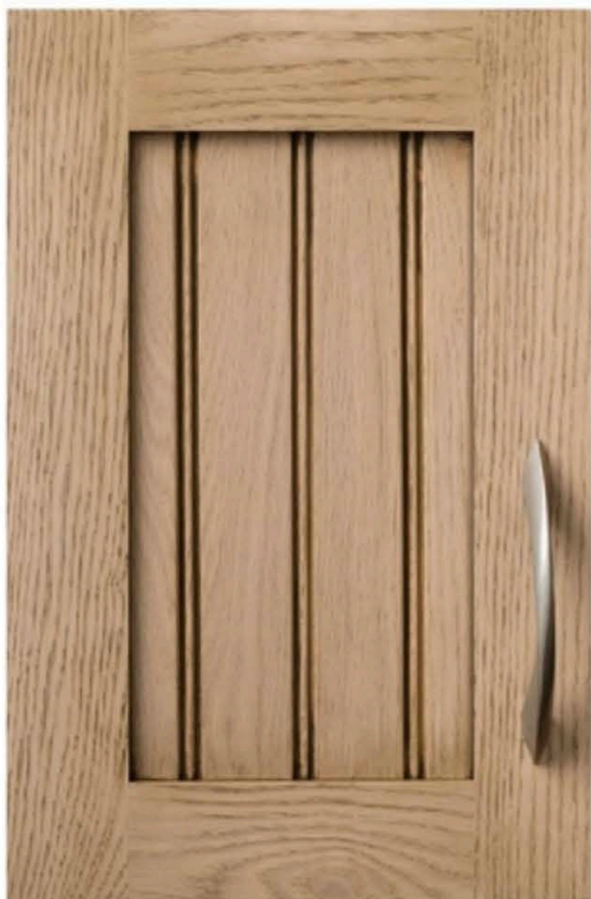
Plain & Fancy's Driftwood Collection evokes the beauty of the ocean shore with oak cabinetry that has been sanded, washed with a white stain, hand-glazed and then finished with a low-sheen top-coat. Available in Silver Shore, Drift Scape and Weathered Stone finishes, it features doors with 2 1 / 4 -in.-wide stiles and rails and solid-wood center panels with 2-in. machined beads. Circle No. 210